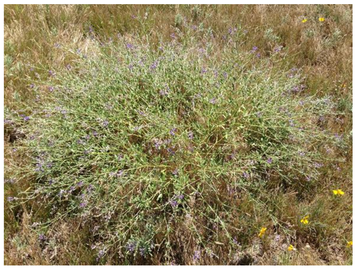
Is it a shrub? No, it's our forb of the week, slimflower scurfpea. Possibly the biggest one I've ever seen.